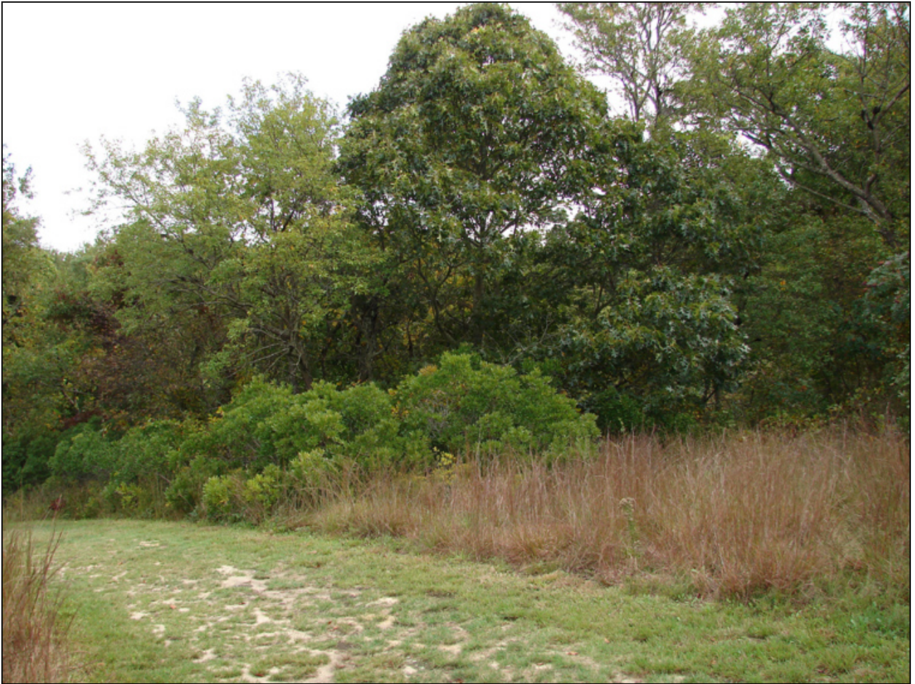
Massed aromatic bayberry as a backdrop for perennial native prairie grasses (Little Blue Stem) along a mowed trail, free of ticks.